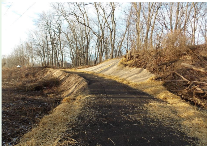
The finished product, looking West up the ramp.

We cannot thank them enough as this saved our volunteers hundreds of man-hours of manual labor with picks and shovels.