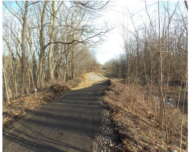
Looking to the East, down the ramp.

An informal survey was made to be sure that the trail stayed on the Knapp's property as it progressed down the side of the railroad embankment. A friend called on American Equipment of Farmington to inquire about renting a backhoe and hiring an operator to carve out a bench-cut for the trail. To our surprise they agreed to donate the equipment and an operator.