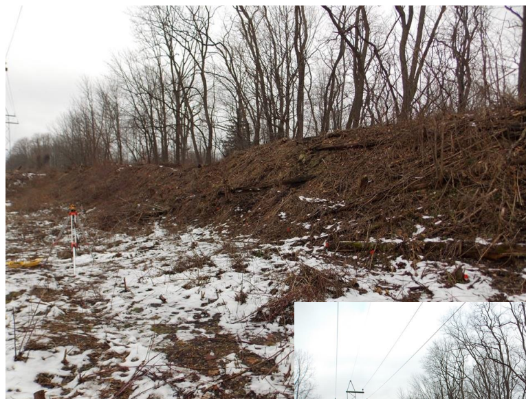
Before major work.