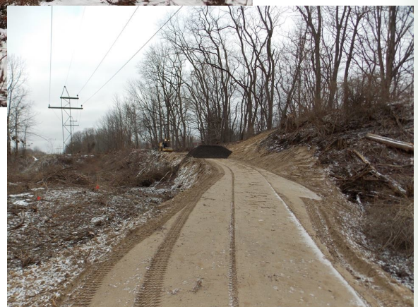
After major work.